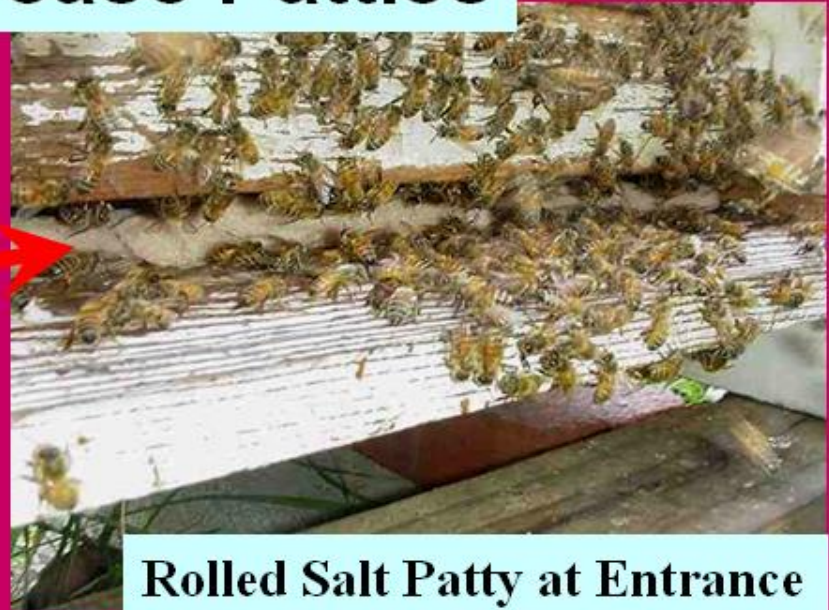
Rolled Salt Patty at Entrance