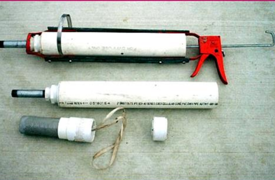
Used in grease guns