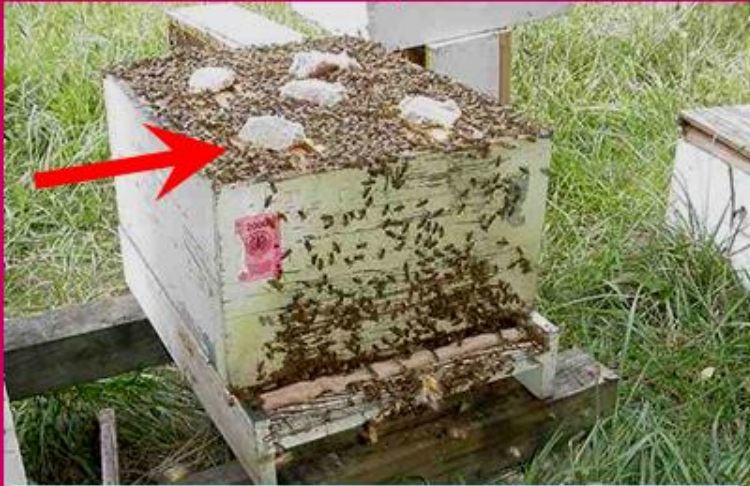
Salt Patties on brood chamber