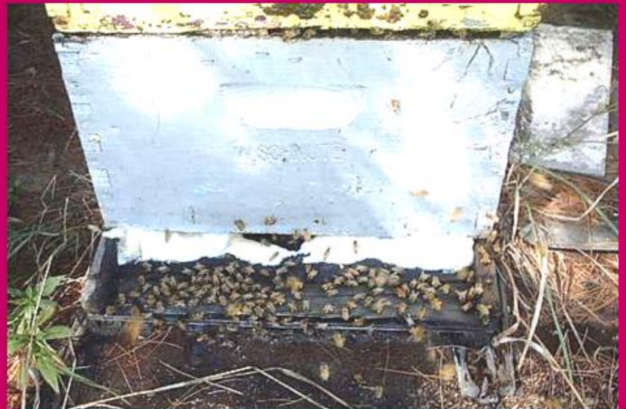
Bead of grease across entrance